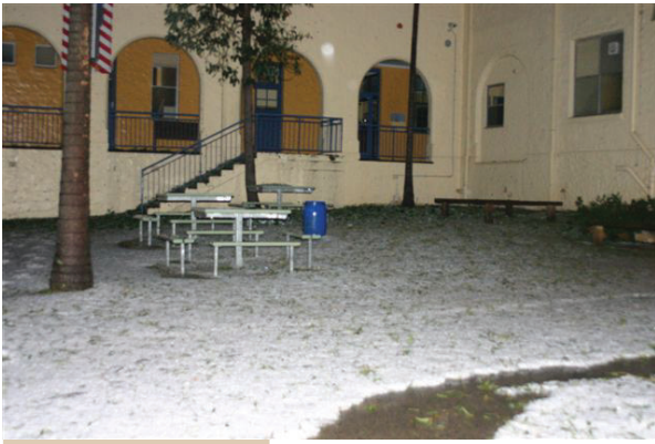
Hail Storm at Padua